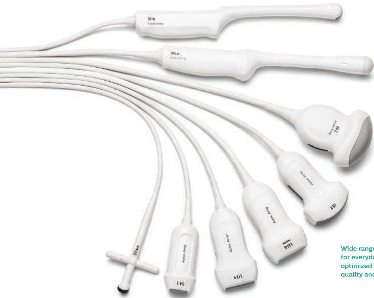
Wide range of transducers for everyday applications, optimized for excellent image quality and plunkability.