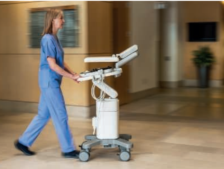
Lightweight and small in size, the ClearVue 850 is easy to maneuver and is a perfect fit in small spaces.